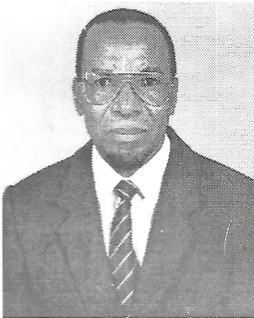
AZAPO President – Cde Mosibudi Mangena

Through this Manifesto, AZAPO invites all patriots of our beautiful country to tackle our problems together. Your support of this struggle will manifest itself in the number of votes you can cast for AZAPO so that it can, through your mandate, implement the proposals contained in this Manifesto.